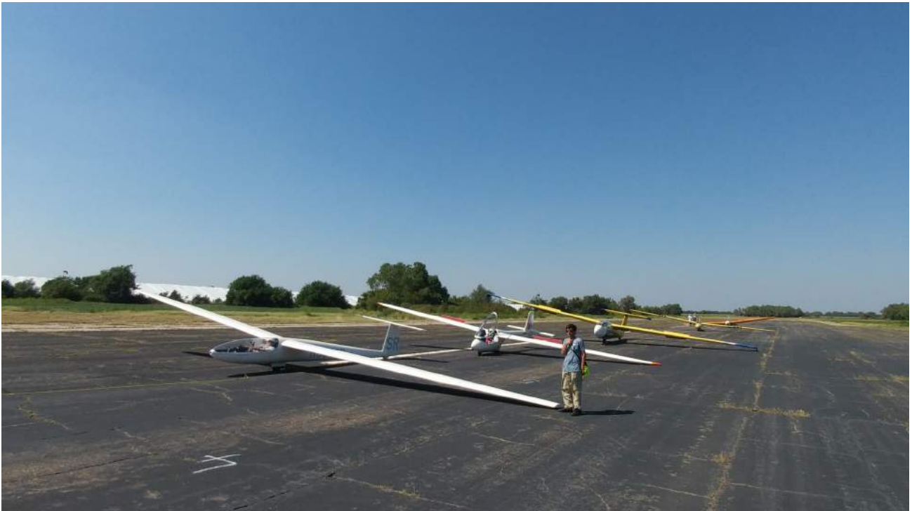
Sunflower Scene on September 2 nd